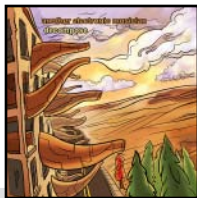
Decompose (2004 / EnpegDigital)

AEM's third full length album, entitled "Five", was released in late 2008 by the n5MD imprint. Returning to the more minimal, beat-driven approach of his debut, Rex avoids simply rehashing the past by infusing "Five" with unexpected stylistic shifts into Techno, Electro and even House all the while maintaining the chaotic, but recognizable patterns of noise that have characterized his releases in the past.