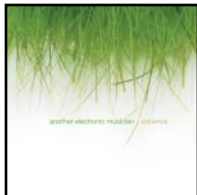
Patience (2006 / n5MD)