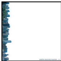
Use (2005 / n5MD)