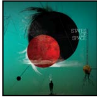
States Of Space (2010 / n5MD)